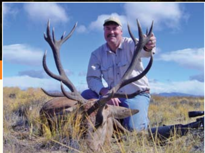
Bag a stag

Whether you choose the rugged foothills of the Andes or the gentler steppe-and-mesa environment of the pampas region, we can customize a hunt to meet your requirements. All locations offer horseback hunting or you may choose to ride in comfortable trucks or ATVs.